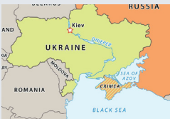
Missionaries in Ukraine

In their most recent communication, one of our missionary couples in Ukraine asked us to continue to pray for the situation in that country. They wrote, "Please pray that the Lord would bring a just end to the war in Ukraine, and that He would make the next steps clear to us."